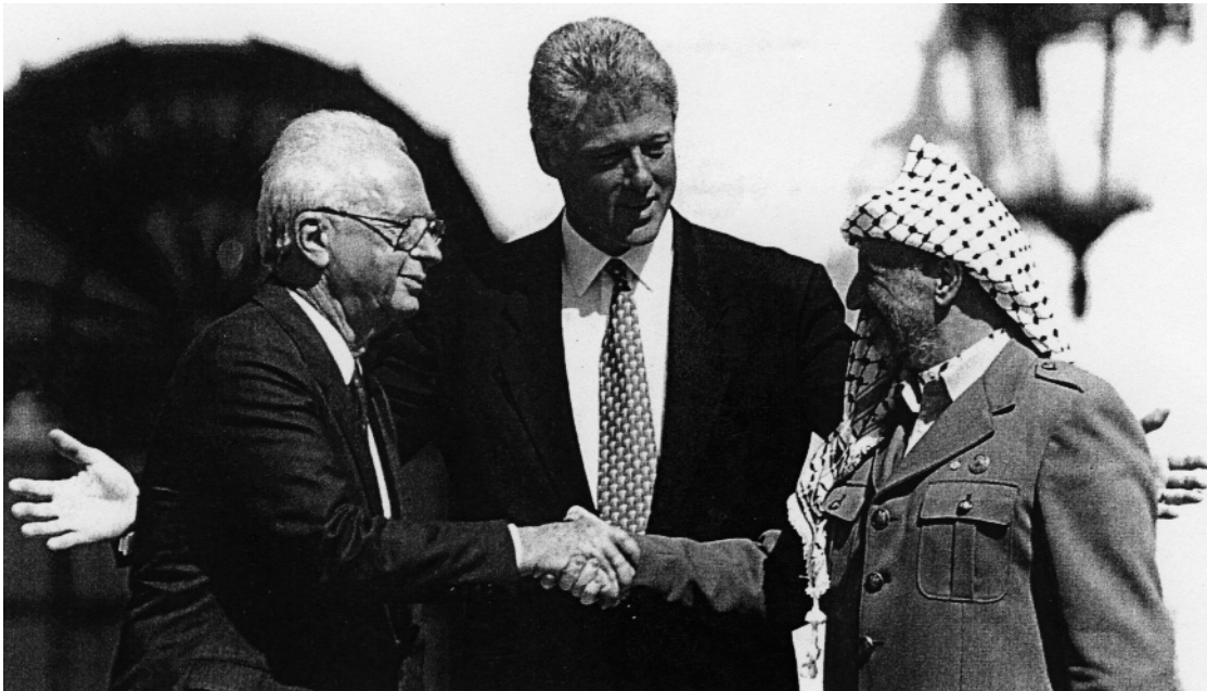
President Clinton with Rabin and Arafat after the signing of the Israeli-PLO peace accord, September 1993.

21 Study the photograph, and then answer the questions which follow.