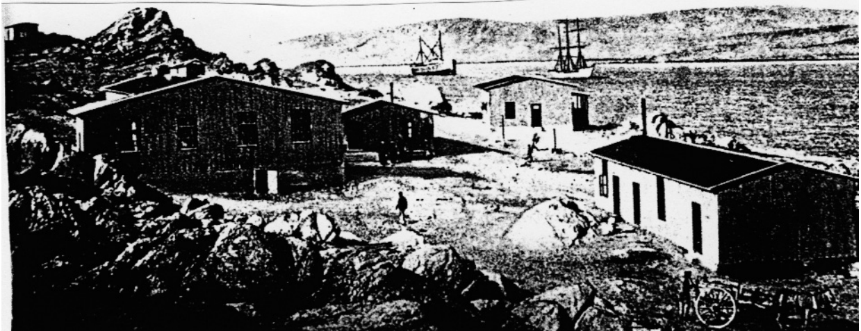
An early German trading post.

19 Study the picture, and then answer the questions which follow.